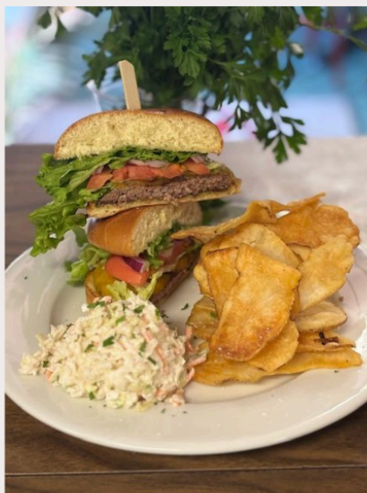
FF = handcut fox fries

PHILLY CHEESE STEAK $12 Sliced steak, grilled peppers, shrooms, onions, provolone, FF